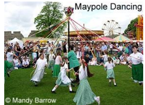
Maypole Dancing - A traditional dance at this time of year